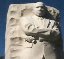
Martin Luther King, Jr. National Memorial